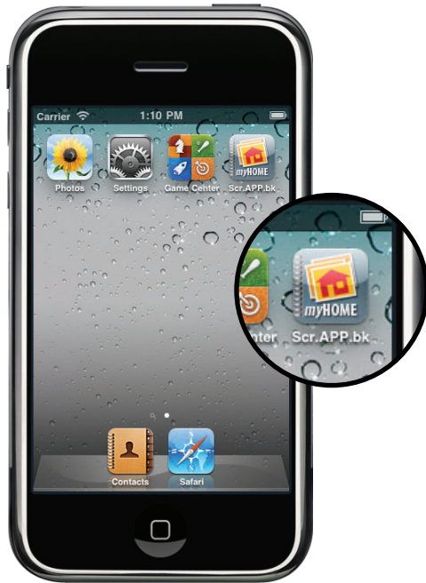
1. Launch App