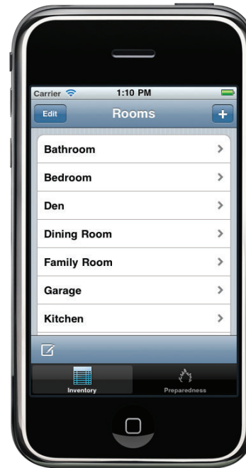
3. Select a room