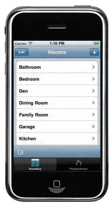
3. Select a room