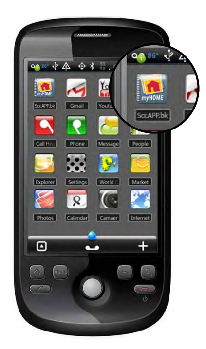
1. Launch App